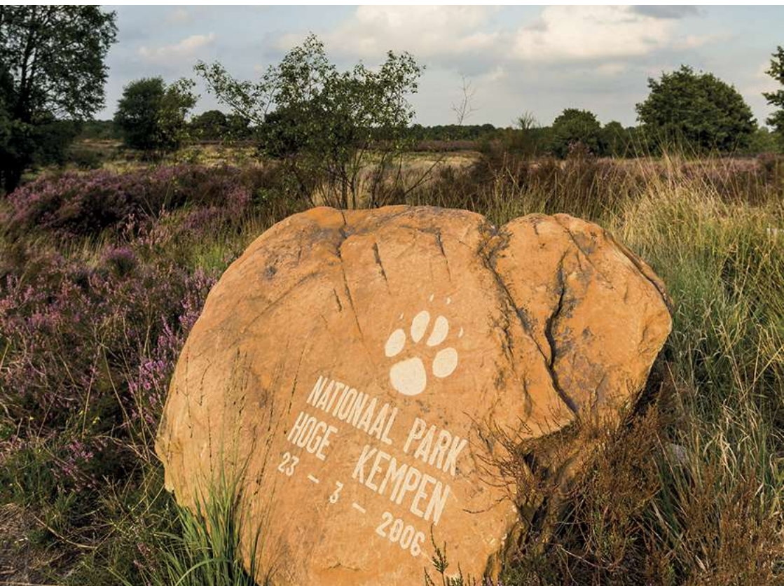
© Regionaal Landschap Kempen en Maasland vzw