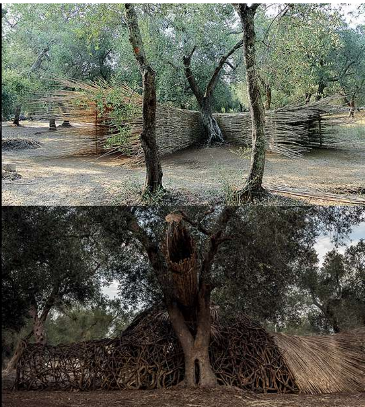
© "Lovo" – studio é cru, "il Nido" – LUA, "La Tana" – Yacine Benseddik